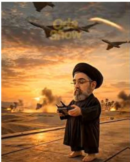
The Iron Umbrella