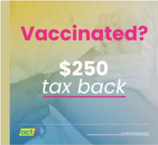
David Seymour 18 October 2021

I hear every day from people who say 'I've done my bit, followed the rules, paid my tax, and got my vax. When do I get a break?' That's why today ACT is launching a policy that would see fully vaccinated Kiwis receive a $250 tax credit. Vax Bucks will reward New Zealanders for doing the right thing and following the rules. If you've had the vax and paid your tax, you deserve some relief. Full story here :