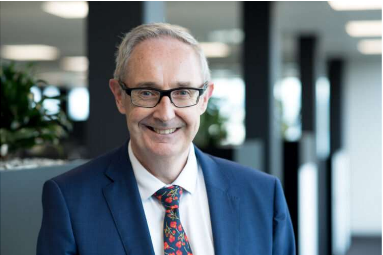
IMAGE: New Zealand Food Safety deputy director-general Vincent Arbuckle says an increase of maximum residue levels of glyphosate found in food won't mean it is unsafe.

New Zealand Food Safety (NZFS) wants to increase the maximum residue level (MRL) for glyphosate (i.e., Roundup) in grains and peas.