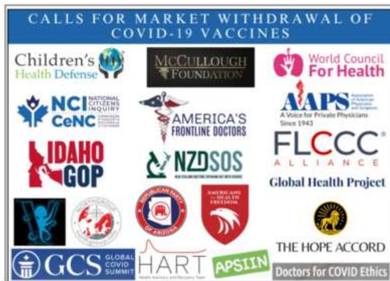
Figure 3. Organizations that Called for COVID-19 Vaccine Market Withdrawal.